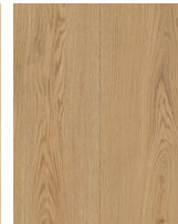
New Haven Light Natural