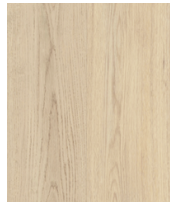
Sanibel Warm White