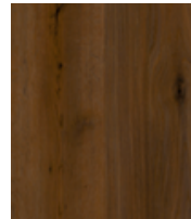
Tacoma Hard Smoked