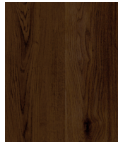
Sonoma Medium Smoke