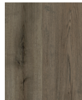
Canton Smoked Grey