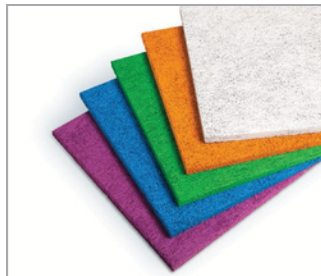
Paintable, with many color options.